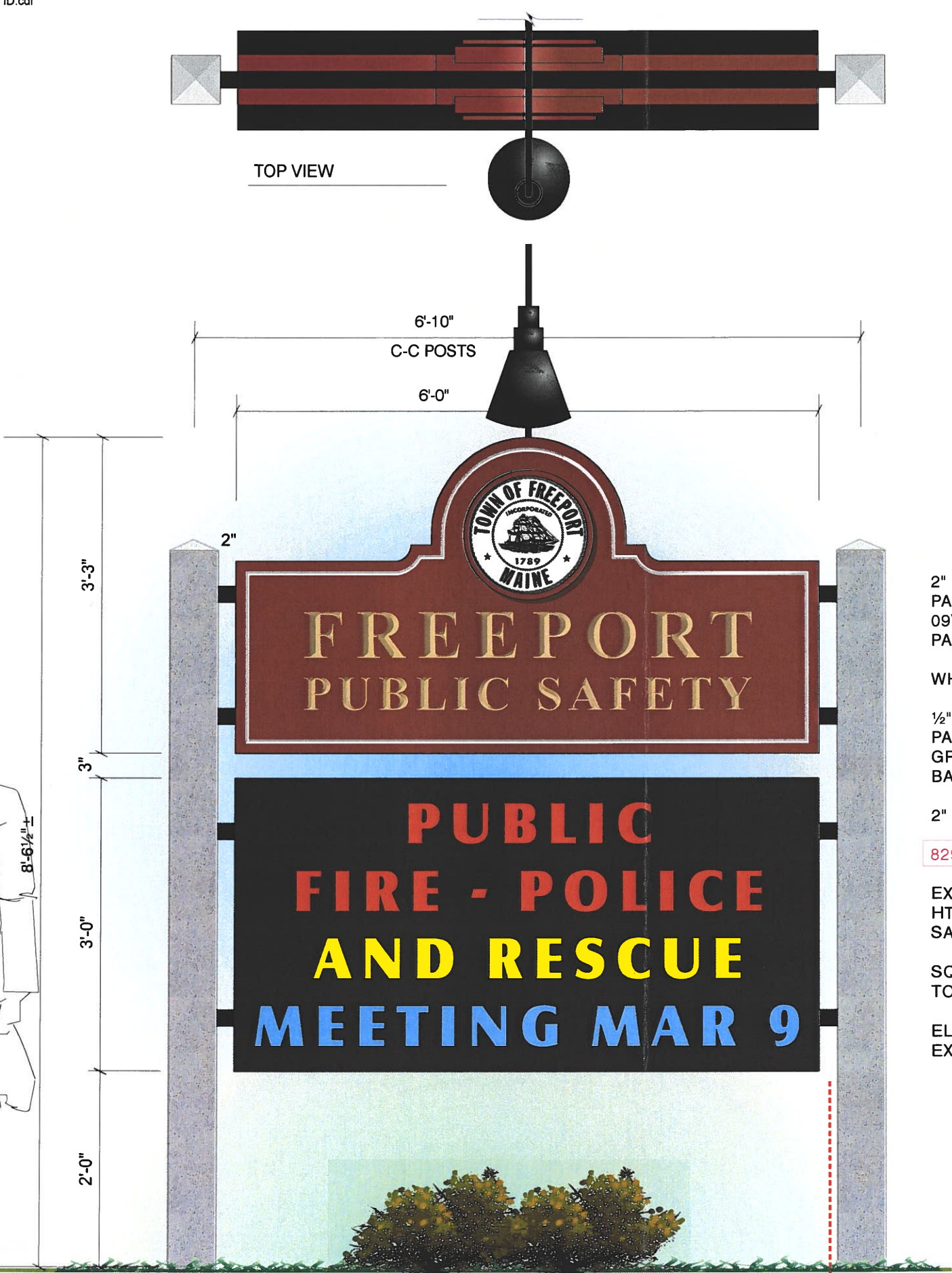
DOUBLE-FACE NON-ILLUM. ID SCALE: 3/4" = 1'-0" (1) REQUIRED

2" DEEP SIGNFOAM BACKGROUNDS, PAINTED 'AKZO' CLASSIC BURGUNDY 09YR 05/305, ROUTED V-GROOVE TEXT PAINTED GOLD METALLIC 'AKZO'-319B4, WHITE V-GROOVE BORDER PAINTED WHITE, 1/2" THICK ACRYLIC TOWN SEAL DISK, PAINTED BURGUNDY, PRINTED TOWN SEAL GRAPHIC, STUD MOUNTED TO BACKGROUND WITH SPACERS, 2" CROSS SUPPORTS PAINTED BLACK, 8292-1 - 'EMC' - 9mm CIRRUS FULL COLOR, EXTERNAL GOOSENECK LIGHTING, HTM R PAD-SB DOUBLE POST ARM ADAPTER SATIN BLACK, 3" BASE SQUARE GRANITE POSTS WITH TAPERED TOP, BY CUSTOMER, ELECTRICAL TO SIGN LOCATION BY OWNER, EXPOSED CONDUIT PAINTED GRAY