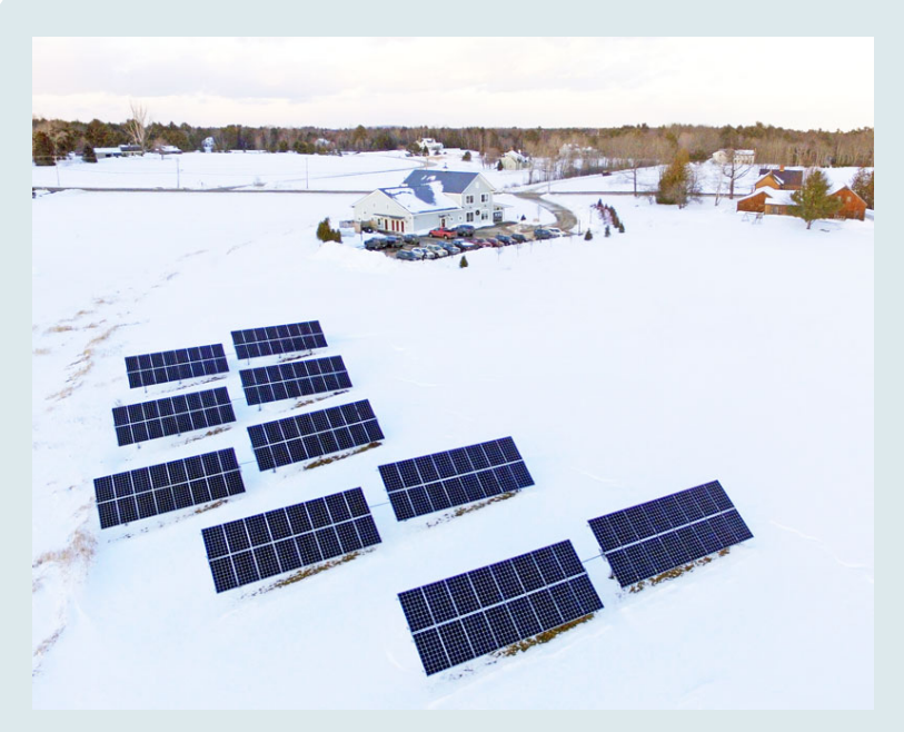
Cumberland Animal Clinic (49 KW)