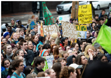
Almost 1000 students attend the March 15 Student Climate Strike in Portland

They are the ones who will inherit this earth we call home and the current climate crisis if it is not dramatically turned around.