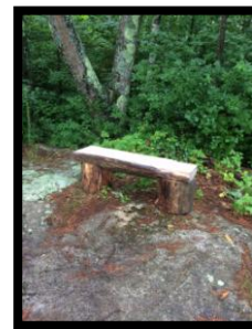
New bench at the top of Hedgehog Mountain

that you can enjoy the view of Mount Washington and the Presidential Range at your leisure. Thanks Quinton!