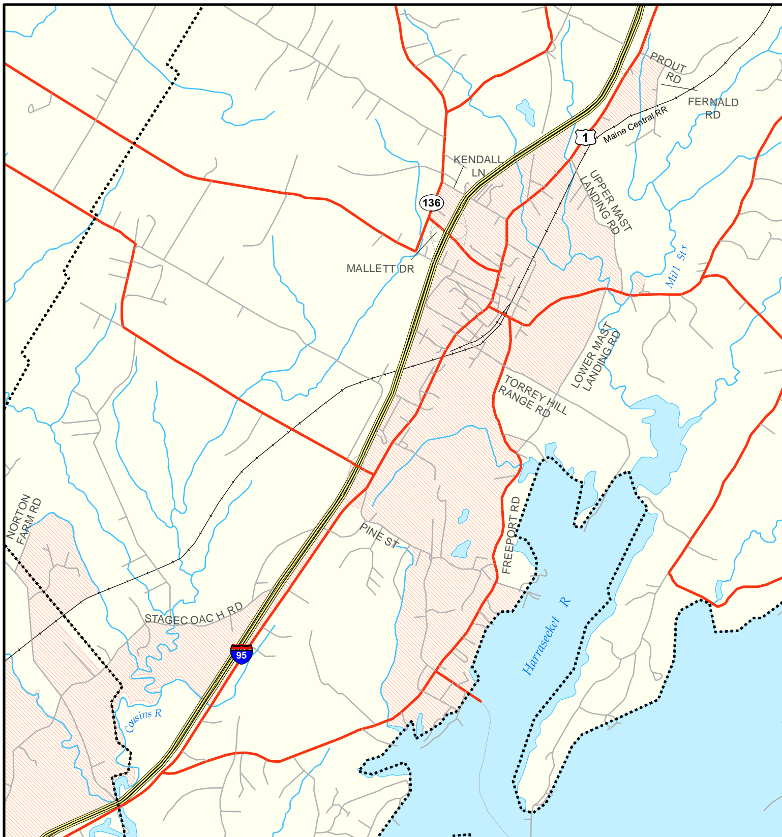
Area of Focus: